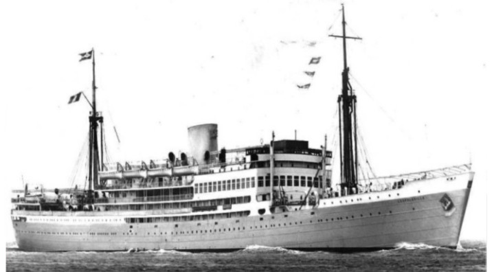
SS Leopoldville 1929-1944

The SS Leopoldville was a 478-foot Belgian passenger ship converted to a troop carrier during the war. It was used mainly for transporting allied troops across the English Channel and did not have sufficient life jackets or accommodations for the 2,000 troops it was able to carry on the short voyage. Nonetheless it had already made 24 channel crossings and transported over 120,000 allied troops to France.