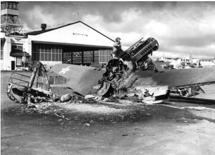
Destroyed P-40 at Wheeler Field

On December 7, 1941, the Japanese military launched a surprise attack on the U.S. naval base at Pearl Harbor, Hawaii, killing over 2,400 Americans and wounding 1,178. The attack, which involved waves of dive bombers and torpedo planes, sank or damaged battleships and destroyed many aircraft. This event directly led to the United States entering World War II the next day.