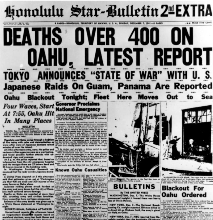
Honolulu Star Bulletin front page