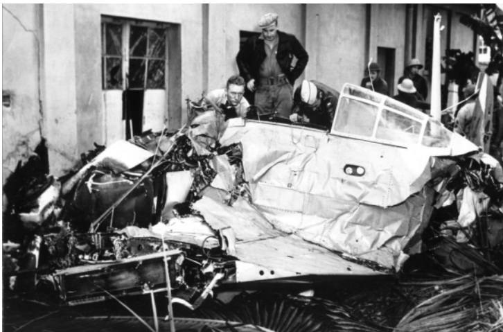
Destroyed Mitsubishi Zero at Fort Kamehameha

On December 7, 1941, the Japanese military launched a surprise attack on the U.S. naval base at Pearl Harbor, Hawaii, killing over 2,400 Americans and wounding 1,178. The attack, which involved waves of dive bombers and torpedo planes, sank or damaged battleships and destroyed many aircraft. This event directly led to the United States entering World War II the next day.