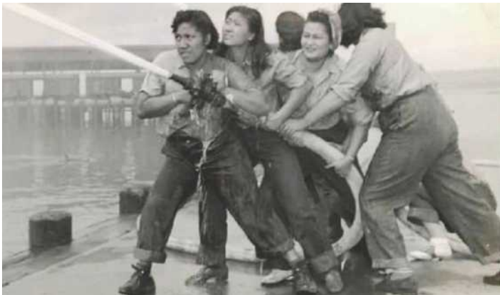
The girls of Hawaii always stand their ground.