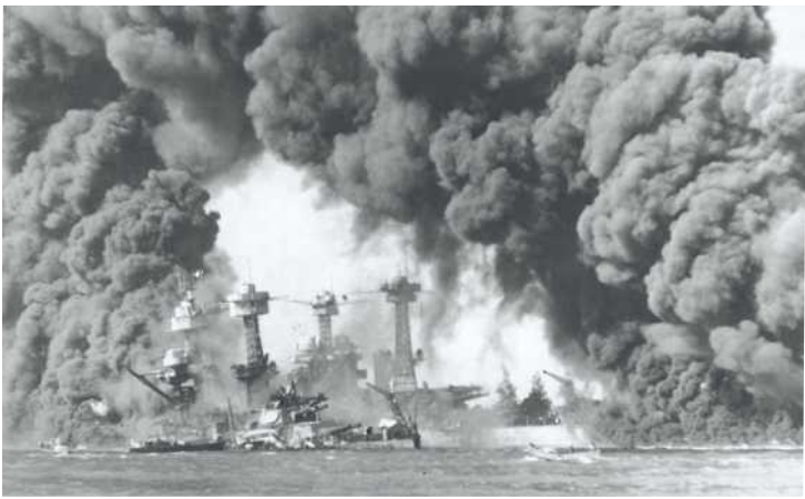
USS West Virginia